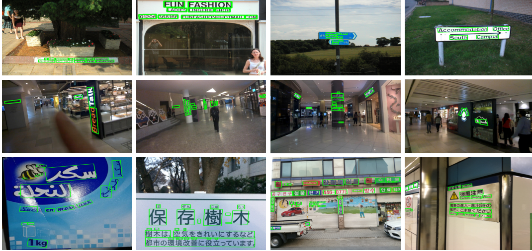
Fig. 3. Examples of scene text detection results by our proposed method.